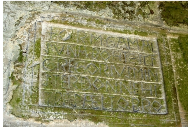
Sundial at St Gregory's Minster

However, although we have no record of how people spoke, the English in the area occupied by the descendants of the Vikings, the Danelaw, probably had a distinctive sound.