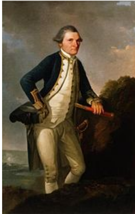
Captain Cook whose discovery of Australia is now disputed.

In the late 18th century Australia and New Zealand were discovered and settled. The accent of Australia owes a lot to the prisoners sent to the penal colonies in this country who mostly came from the London area.