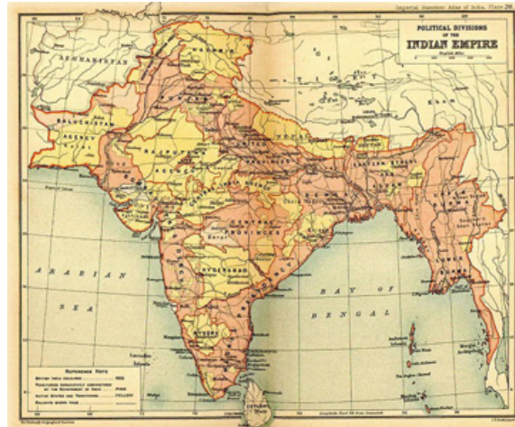
Map of India during colonial times before the partition of India and Pakistan

During the 19th century the Indian subcontinent was colonised by the French and later by the English. Nowadays English is an official language in both India and Pakistan.