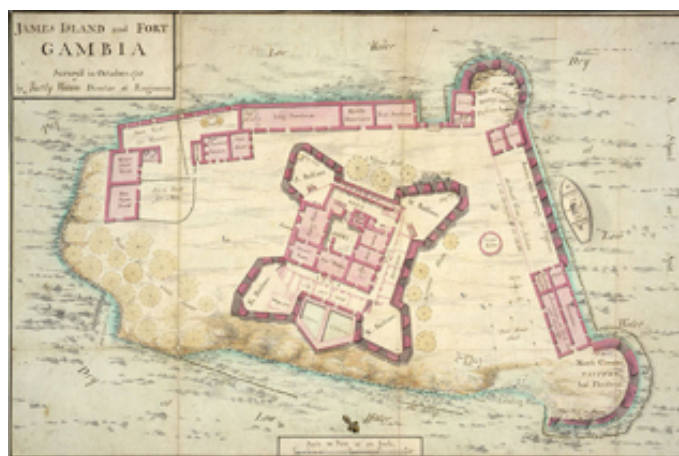
First permanent British settlement on the African continent made at James Island in the Gambia River. (Image of James Island and fort)

English also spread to Jamaica and Africa in the 17th century. Here the influence of African languages is notable. This led to the creation of pidgins and creoles (see Jamaican example) and the use of English as an official language alongside African languages (see Nigerian example).