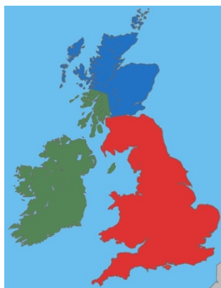
Britain before the Anglo-Saxons

We must remember that before, during and after the Romans left Britain, England, Wales or Scotland did not exist. The whole island was occupied by Celtic tribes.