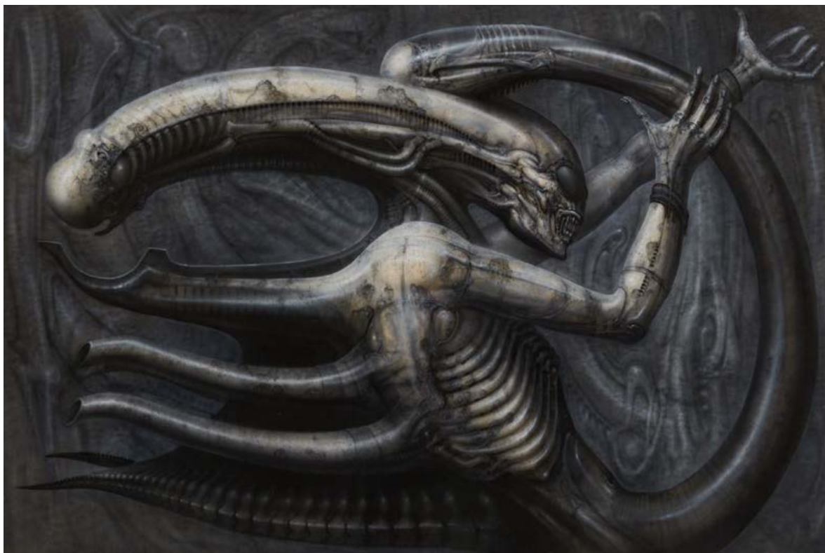
H.R. GIGER Alien Monster - Necronom IV (1976) Acrylique sur papier et bois