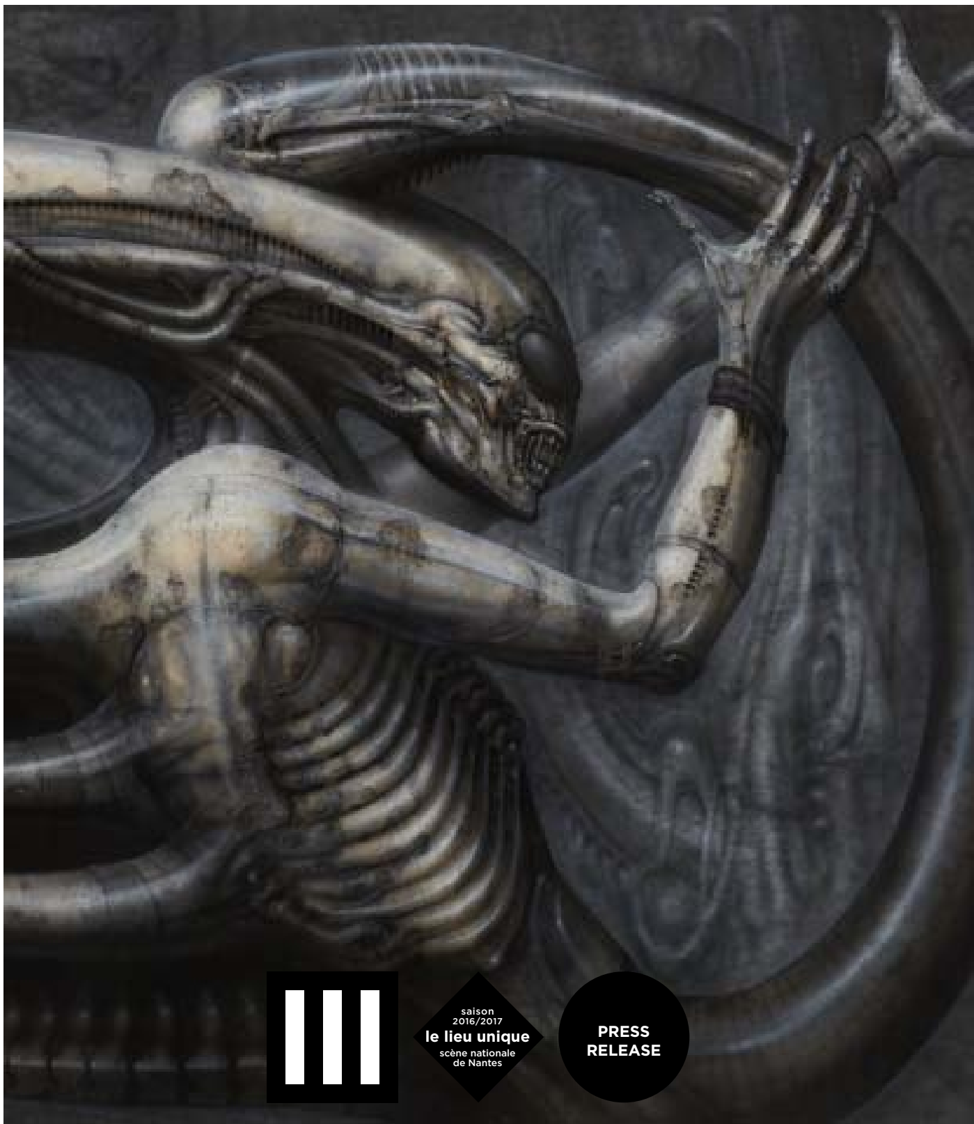
HR Giger, Necronom IV, 1976