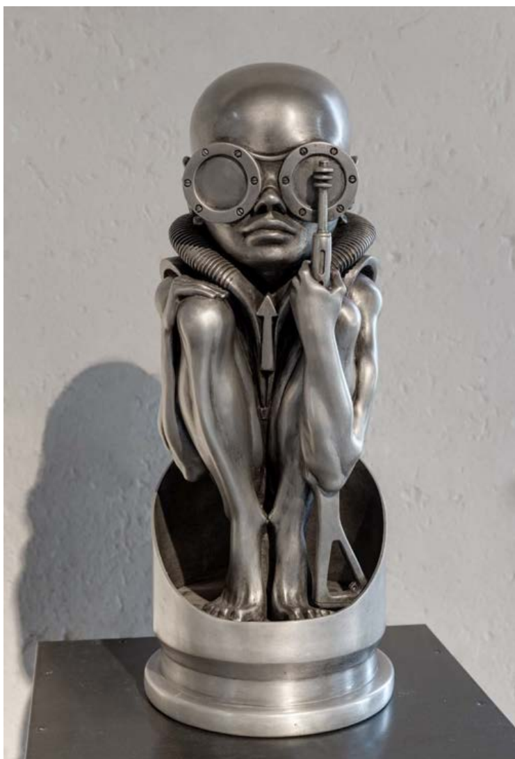
H.R. GIGER Birthmachine baby (1998) Bronze