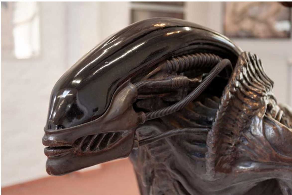
H.R. GIGER Necronom (Alien III) (2005) Polyester et metal