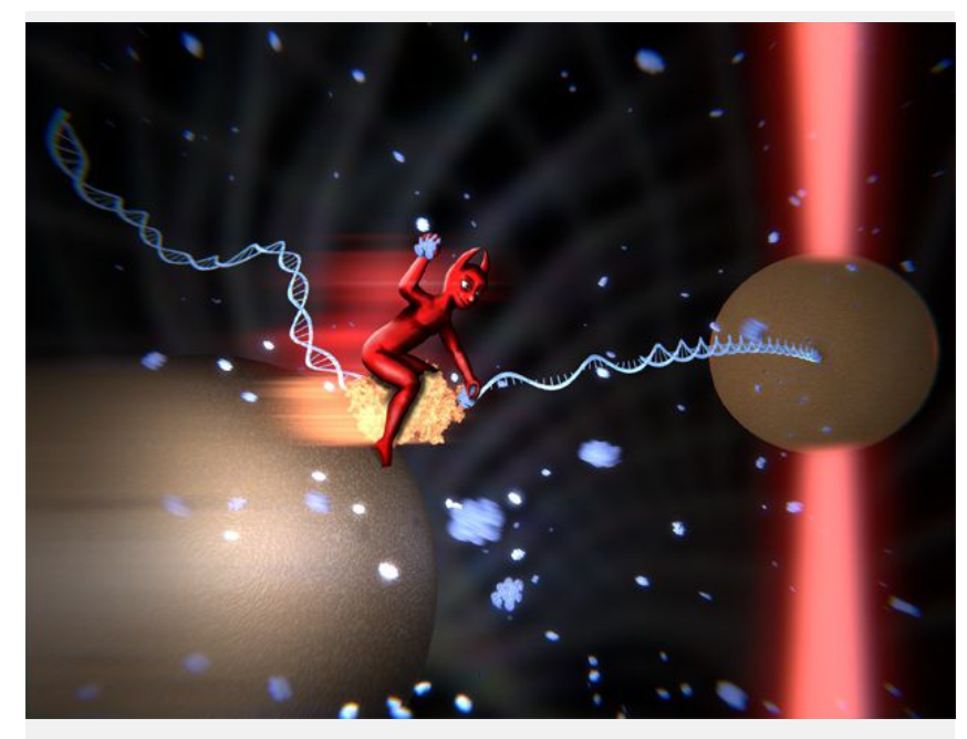
Figure 1. Maxwell's demon controlling the stepping of a DNA polymerase molecule. In real DNA polymerases, binding of the next correct nucleotide plays the role of Maxwell's demon, by pinning the fluctuating polymerase in the post-translocation state -and the second law of thermodynamics is certainly not violated (Morin, et al. Nucleic Acids Res. 2015, 43:3643).

Much of the current biophysical research in Genetics involves the application of 'classical', and the development of novel, techniques to study DNA, RNA and proteins in crystals, in solution, in cells, and in organisms. Fluorescent imaging techniques, as well as electron microscopy, x-ray crystallography, NMR spectroscopy, atomic force microscopy (AFM) and small-angle scattering (SAS) both with X-rays and neutrons (SAXS/SANS) are used to obtain information about the electronic structure, size, conformational changes, polarity, and modes of interaction of genes and their products.