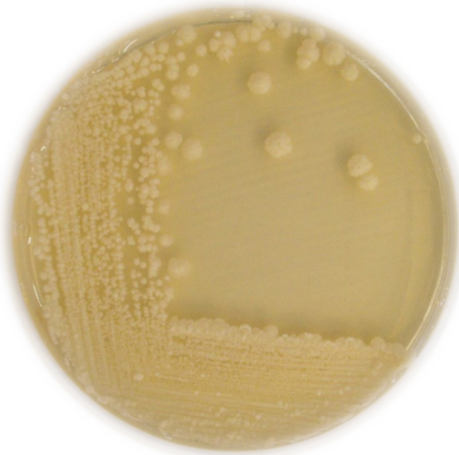
SABOURAUD Agar Typical colonial morphology