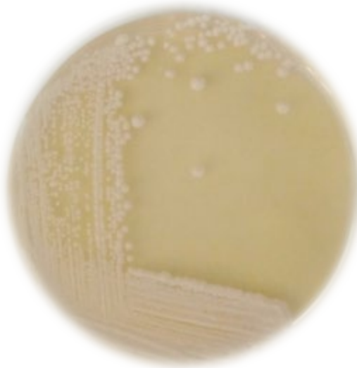
SABOURAUD Agar Typical colonial morphology