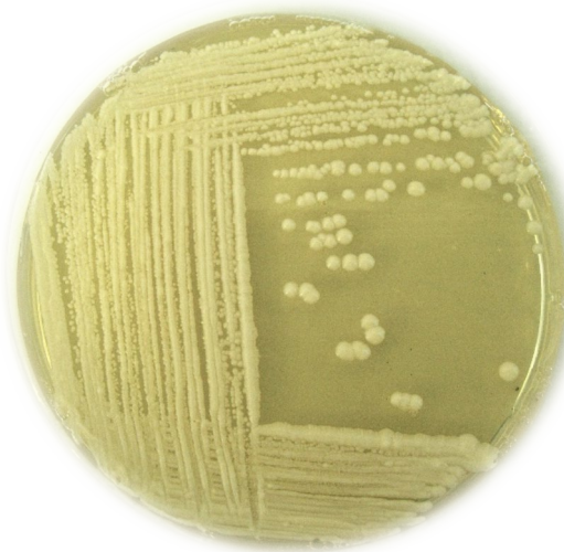
SABOURAUD Agar Typical colonial morphology