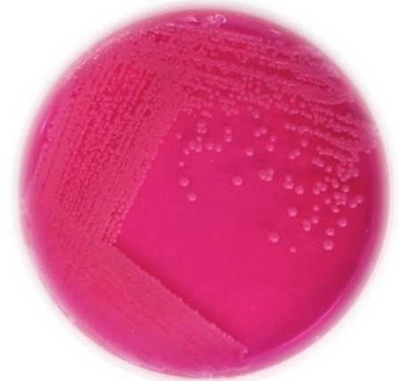
DRBC Agar (Dichloran Rose Bengal Chloramphenicol) Pink colonies and reduced size