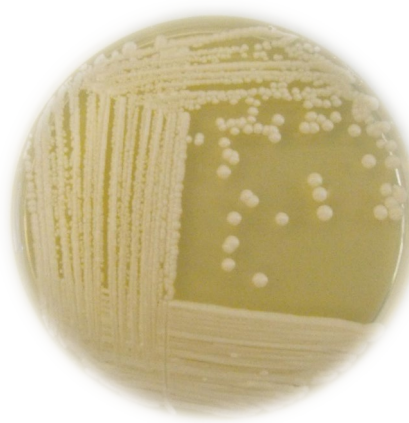
SABOURAUD Agar Typical colonial morphology