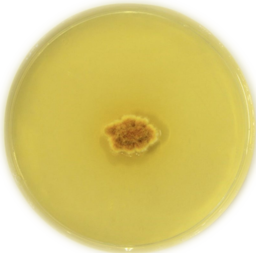
SABOURAUD Agar* Typical colonial morphology