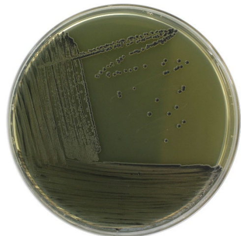
BAIRD-PARKER + RPF agar Black colonies without coagulase zones