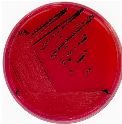
Chromogenic XLD agar Red colonies with black centres