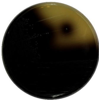
Bile Aesculin Agar Blackening of medium around colonies