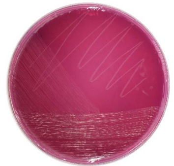
VRBGA ( Violet Red Bile Glucose Agar ) AGAR Total inhibition