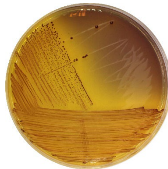
KF Agar (+ TTC solution 1%) Red or pink colonies, surrounded by a yellow zone