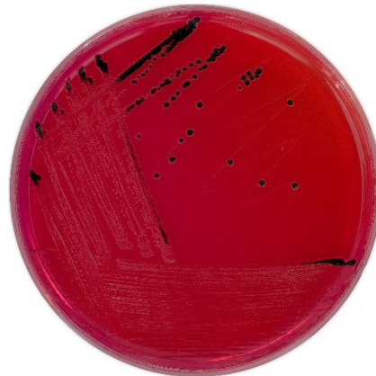
Chromogenic XLD agar Red colonies with black centres