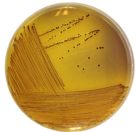
KF Agar (with TTC solution 1%) Red or pink colonies, surrounded by a yellow zone