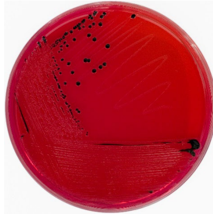
Chromogenic XLD agar Red colonies with black centres