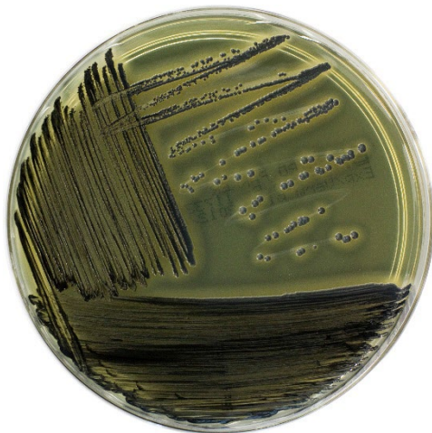
BAIRD-PARKER agar Grey/black shiny colonies with white entire margin surrounded by zone of clearing