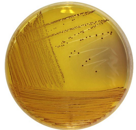
KF Agar (with TTC solution 1%) Red or pink colonies, surrounded by a yellow zone