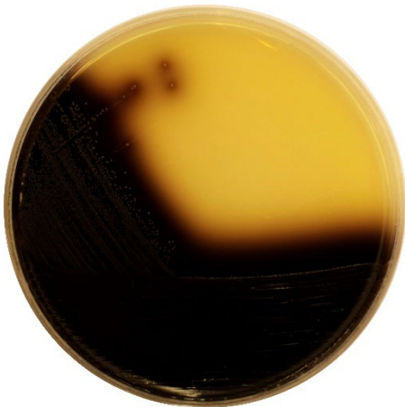
Bile Aesculin Agar Blackening of medium around colonies