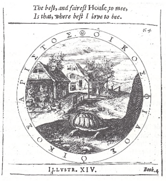
Fig. 1. "OIKOS PHILOS, OIKOS ARISTOS" (G. Wither, Collection of Emblemes, 1635).

I. ar'is-toc'ra-cy (from the Greek aristokratia, from aristos, best + kratein, to be strong,