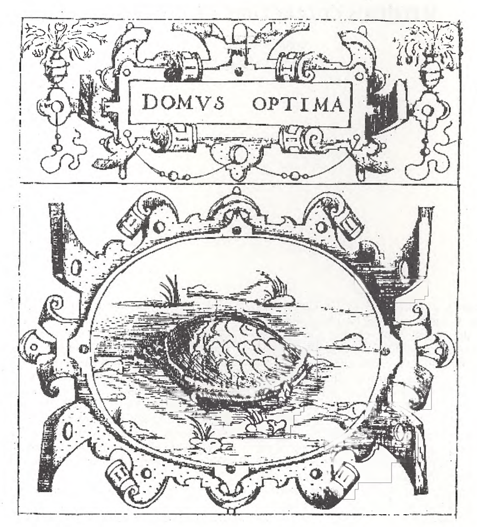
Fig. 2. "DOMUS OPTIMA" (J. de Borja, Empresas morales, 1680).

rule): Rule by the best; hence, government by a relatively small privileged class; also, the ruling body of such a government, [etc].