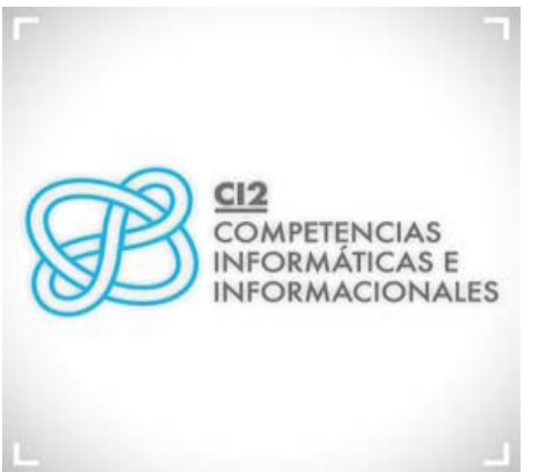
Library instruction – Information literacy