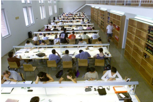
Reading rooms +1100 seats