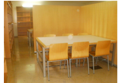
Teamwork rooms: -1 North 0B North