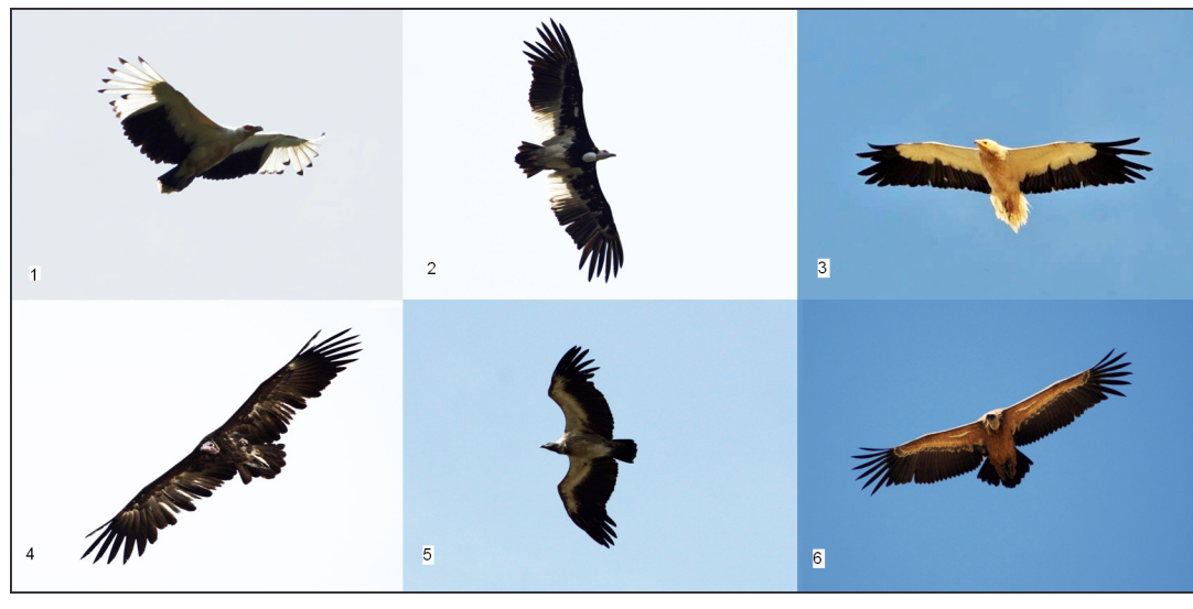
Fig. 2. – Some species of West Africa vultures: 1) Palmnut vulture; 2) White-headed vulture; 3) Egyptian vulture; 4) Hooded vulture; 5) White-backed vulture; 6) Eurasian Griffon vulture (original pictures by Di Vittorio M., Zafarana M., Gioitta N.).

each species, we also report distribution and population trend in West Africa (BirdLife International 2016).