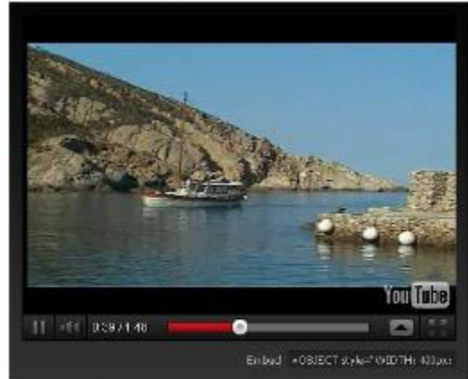
September, 2009 - Start up of the ARGOMARINE project. Broadcast by Italian RAI3 Network, September 2009 (language: Italian)

Sending out a press release is a good way to promote these actions. For us, it was helpful to include a link to a video clip that introduced our work. We hired professionals for that, so that the imagery and style were very accessible. Professionals have also recently helped us in creating a social media presence, which has definitely increased our visibility. I think it would be advisable to dedicate a budget to this type of assistance right from the start of a project.