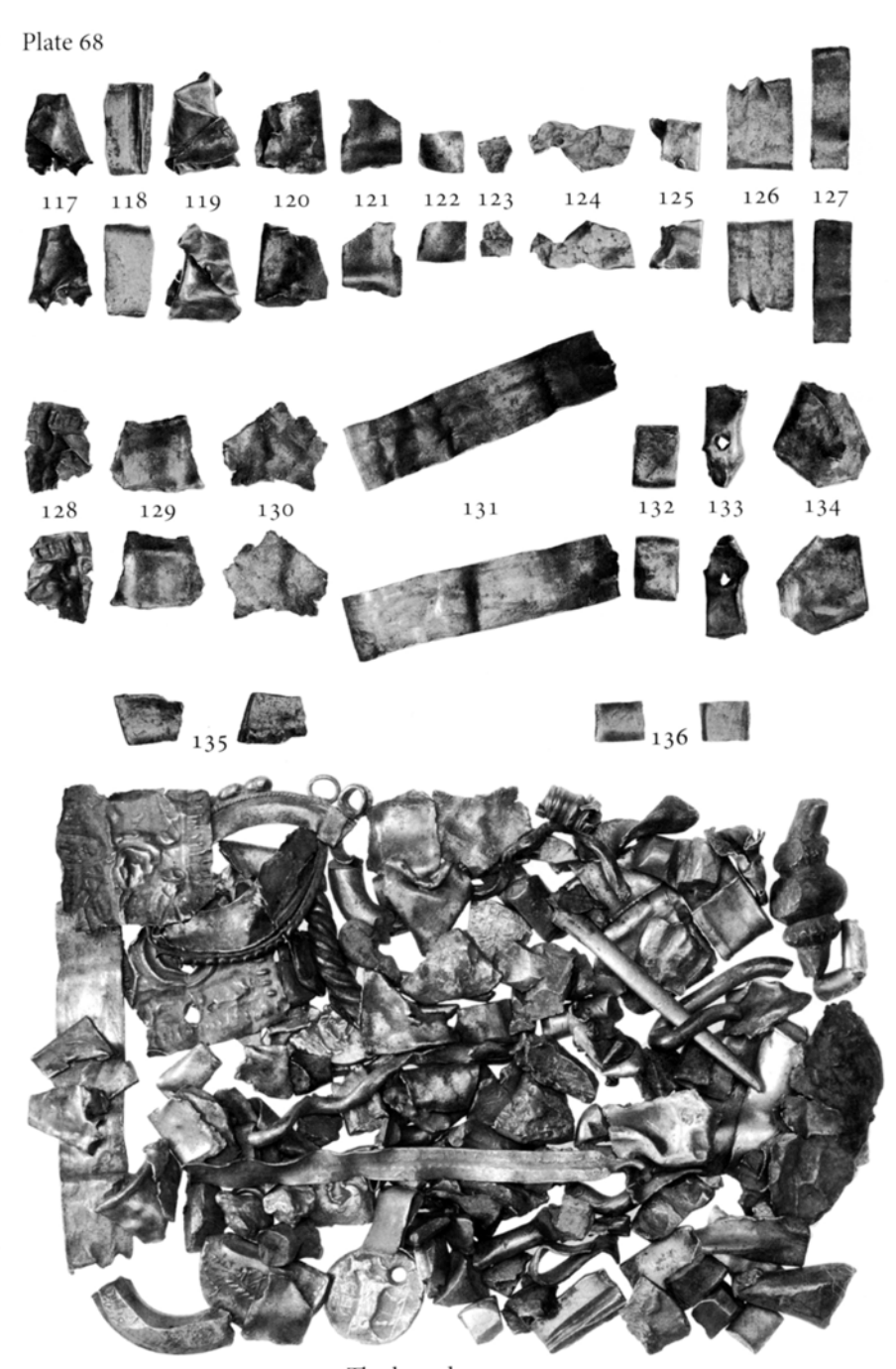
The hoard en masse A New Celtiberian Hacksilber Hoard, c. 200 BCE