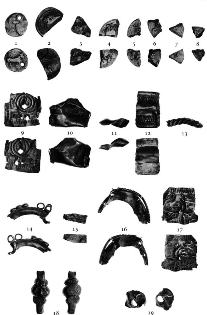
A New Celtiberian Hacksilber Hoard, c. 200 BCE