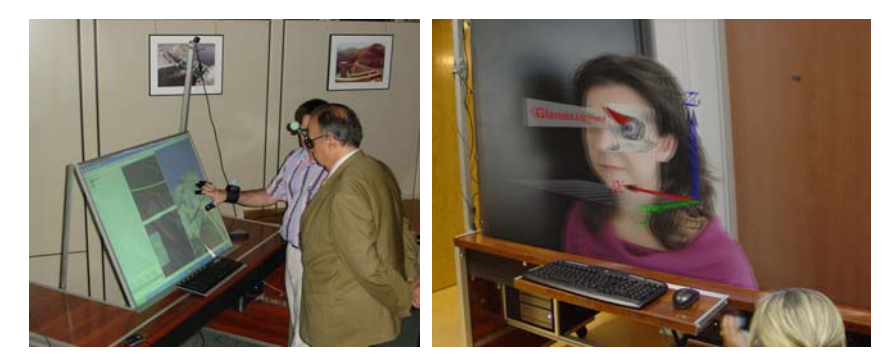
Fig. 3. Some snapshots of VALLE and VISUALG running on SOROLLA during the evaluation session

In order to obtain these results we organized a evaluation session at our laboratories in early June 2006. In this experiment, a selected set of 40 students and staff of our university were invited to test SOROLLA in a session of two hours of duration. All the participants performed the same sequence of six exercises (three executed on VALLE and the rest executed on VISUALG) using the three different immersive visualization devices. The evaluation test (see Figure 3) lasted roughly one hour and a half including a brief training, the exercises, and the time to fill out the final evaluation forms. The participants ranged in the age from 19 to 55 years and 22 (55%) were men. The educational levels among the participants ranged from grade school through doctoral level.