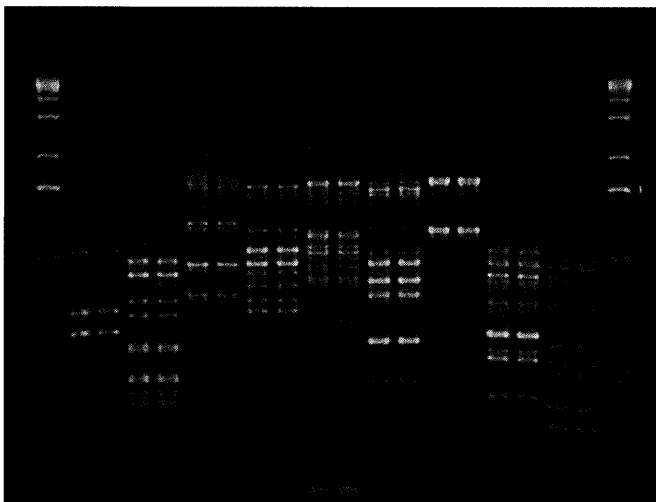
Fig. 1 Agarose gel depicting replicated DNA amplifications of 'Golden Acre' accession 1 with nine selected decamer primers. Lanes 2,3 were amplified with OPB-04, lanes 4, 5 were OPB-10, lanes 6, 7 were OPB-19, lanes 8, 9 were OPB-20, lanes 10, 11 were OPV-04, lanes 12, 13 were OPV-12, lanes 14, 15 were OPV-13, lanes 16, 17 were OPW-16, and lanes 18, 19 were OPY-08. Lanes 1 and 20 are 1-kb size standards

ed by utilizing a 1-kb DNA ladder (BRL, Bethesda, Md., USA) and a computer program, Size-It!, designed by Dr. Jeffrey Lawrence, Department of Genetics, Washington University, St. Louis, Mo., USA. The gels were stained with ethidium bromide and photographed with black and white film #667 (Polaroid, Cambridge, Mass., USA) under UV light. Reproducibility was checked by running replicate samples across amplifications for each primer (Fig. 1).