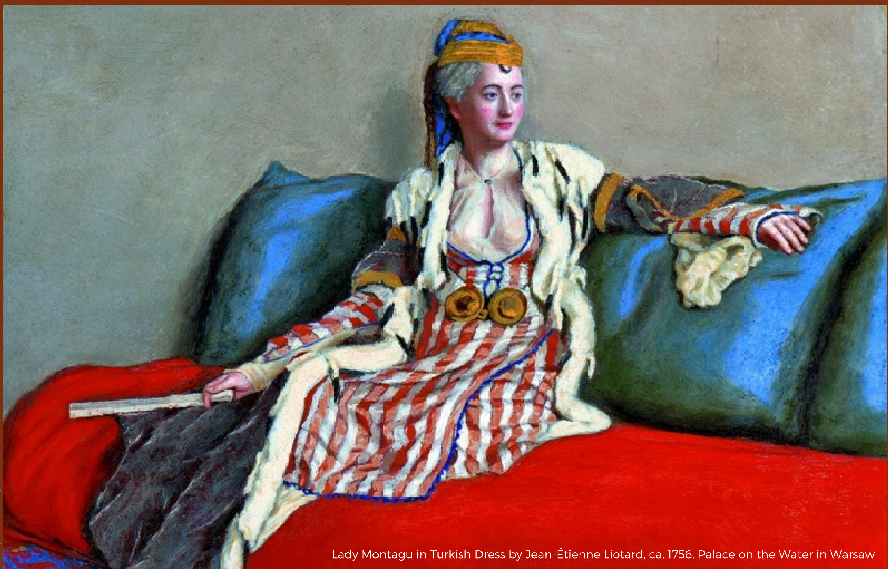
Lady Montagu in Turkish Dress by Jean-Étienne Liotard, ca. 1756, Palace on the Water in Warsaw

Graphic design: Inma Aleixos Borrás (CIRGEN AdG 787015)