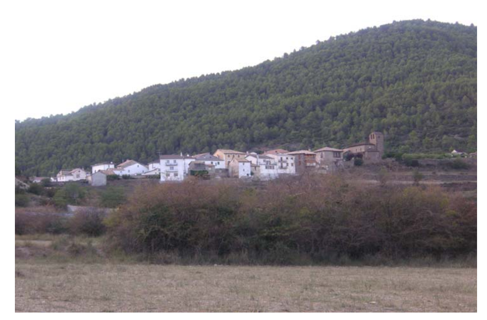
Landskape of Triste (Huesca)