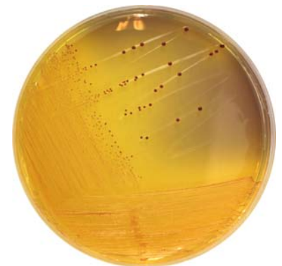
KF Agar (with TTC solution 1%) Red or pink colonies, surrounded by a yellow zone