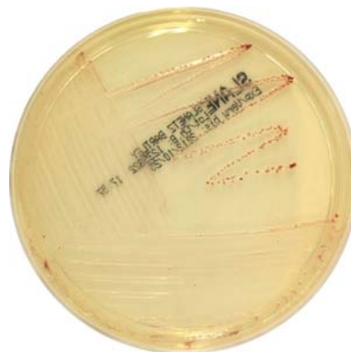
Slanetz-Bartley Agar (with TTC solution 1%) Red or brown colonies