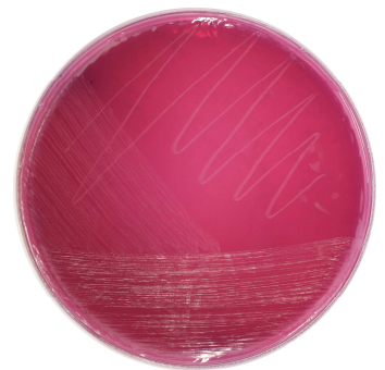
VRBGA ( Violet Red Bile Glucose Agar ) AGAR Total inhibition