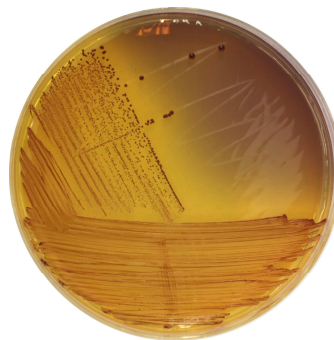
KF Agar (+ TTC solution 1%) Red or pink colonies, surrounded by a yellow zone