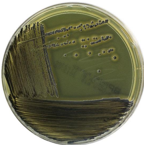
BAIRD-PARKER agar Grey/black shiny colonies with white entire margin surrounded by zone of clearing