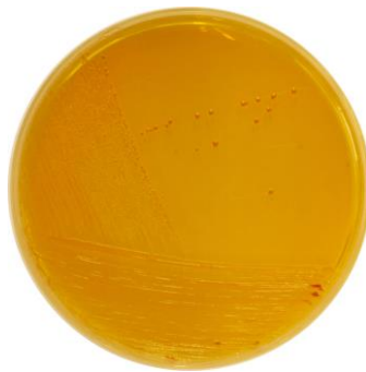
TERGITOL AGAR Yellow colonies with yellow zone. Sometimes with rust coloured centre