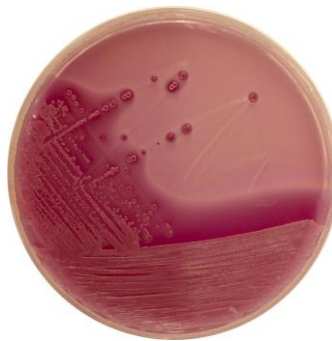
VRBGA ( Violet Red Bile Glucose Agar ) AGAR Red-purple colonies surrounded by purple haloes