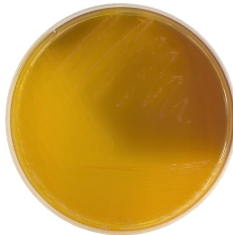
KF Agar (with TTC solution 1%) Red or pink colonies, surrounded by a yellow zone