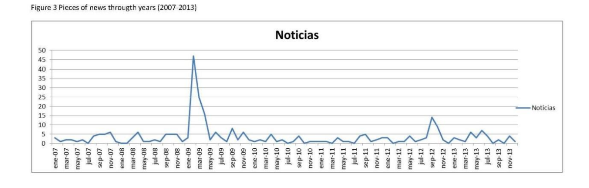
Figure 3 (Moreno-Lopera_Figure 3)

42 of 121 stories were published in the newspapers from Valencian Community, as is shown in the second graph.