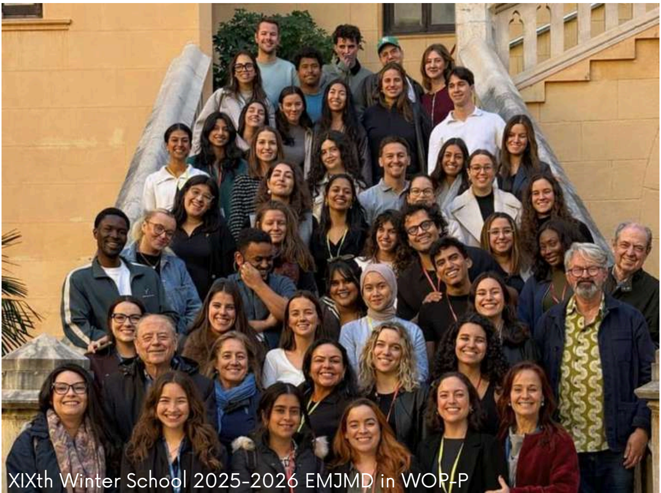
XIXth Winter School 2025-2026 EMJMD in WOP-P