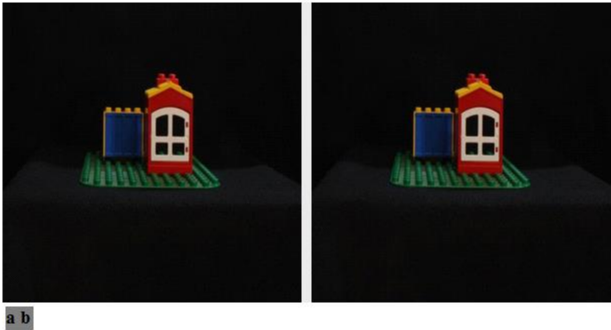
Figure 1. central view (8th vertical and horizontal view) of the plenoptic image a) the original image b) the watermarked image. k= 90 and PSNR= 57.34dB

Figure 1 shows the central view of the original and watermarked plenoptic image (8th vertical and horizontal view). The embedded and extracted watermark are displayed in figure 2. Figure 3, 4 show the PSNR and BER of the proposed method for different values of the gain factor. As it can be seen from figure 3 and 4, for k = 90 the PSNR of the watermarked image is more than 57dB. Please keep in mind that if the watermarked image is not subject to any attack, for any gain factor the embedded watermark can be extracted perfectly with BER= 0.