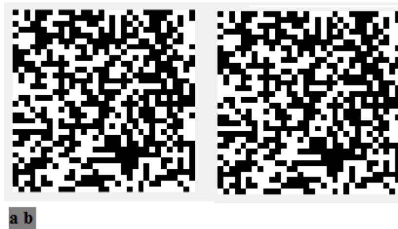
Figure 2. a) embedded logo b) extracted logo (k= 90)