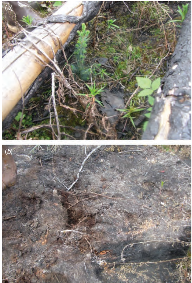
Fig. 4. In Alaska taiga north of Fairbanks: (a) post-fire recruitment of black spruce ( Picea mariana ) in sphagnum substrate; and (b) higher-intensity burned spots where safe sites for spruce are eliminated, leaving substrate more suitable for broadleaf tree establishment.

One example that comes to mind is a recent paper by Kimball et al. (2018) who set out to sort out the most important disturbances in a nature reserve in southern California. Using a long-term monitoring dataset, they found sage scrub shrublands recovered after fire and concluded fire was not a threat on