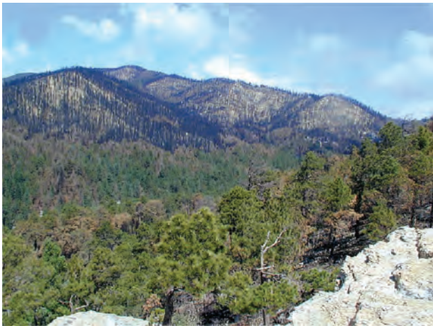
Fig. 3. Wildfire in ponderosa-dominated forests where the more natural low-intensity understory burning seen in the foreground is replaced by high intensity evident in the background. As these pines require surviving parent trees for seed sources, the background landscape, owing to limited dispersal ability and lack of seed sources, is likely to lack forest recovery for a century or more.

being consumed. This is the proximal cause although it is acknowledged that the ultimate cause is a reduction in fire frequency due to effective fire suppression.