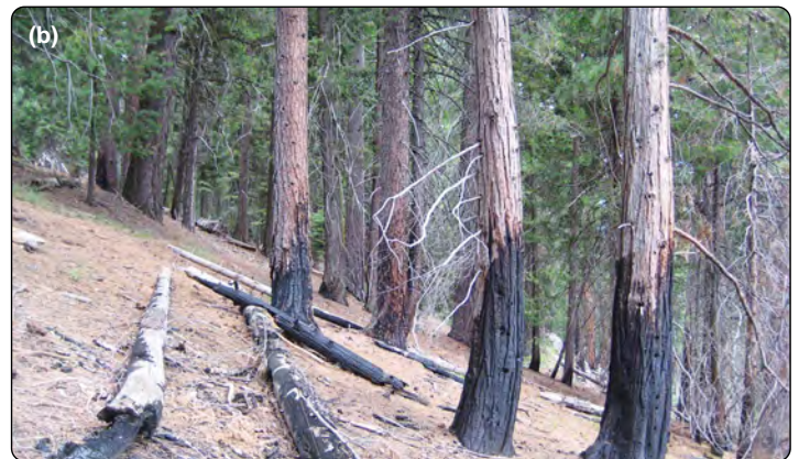
Figure 2. (a) Wildfires and burns have been used to facilitate hunting for millennia; here, Nola Taylor, a member of the Martu People in Western Australia, burns spinifex grass ( Spinifex sp) to flush out small game during a hunt. (b) In forests, frequent understory wildfires reduce vertical fuel buildup and prevent the occurrence of large, high-intensity fires that are often catastrophic to both the forest and human communities (shown here is a mixed Pinus ponderosa and Calocedrus decurrens forest in California's Sequoia National Park).