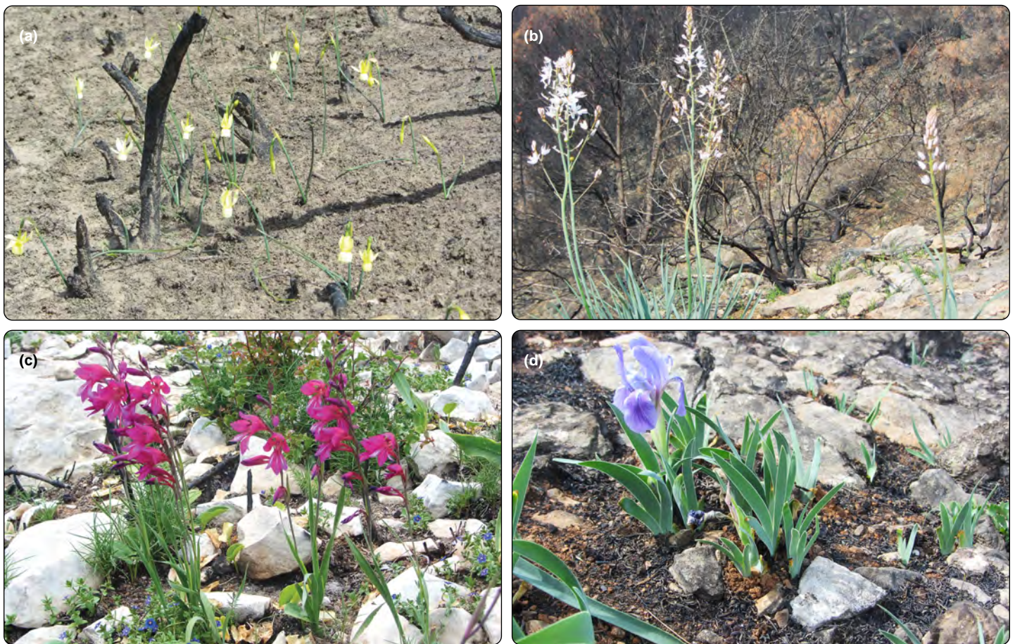
Figure 3. Fire-prone ecosystems are rich in geophytes that flower very quickly after a fire event (fire-stimulated flowering). These species are the first to enhance pollination activity; their underground organs were also an important source of carbohydrates for early humans, and they are the ancestral species of many common contemporary garden plants. Pictured here are geophytes native to Spain that flower quickly after a wildfire: (a) Narcissus triandrus pallidulus , (b) Asphodelus cerasiferus , (c) Gladiolus illyricus , and (d) Iris lutescens .

loads. In British Columbia, Canada, for instance, lungworm ( Protostrongylus spp) loads were up to 10 times smaller in native Stone's sheep ( Ovis dalli stonoi ) that had access to recently burned areas than in sheep that did not (Seip and Bunnell 1985). There is evidence that fire suppression increases the risk and transmission of infectious disease pathogens (eg including those carried by organisms such as ticks, chiggers, fleas, lice, mosquitoes, and a diversity of flies) and modifies host-parasite dynamics in a range of systems (Scasta 2015). For instance, burns are currently used to control the spread of some pest-related problems, such as mosquito-borne diseases. Scasta (2015) referenced 24 studies that document the effects of fire, 23 of which demonstrate fire as an effective tool for managing vegetation, parasites, and disease. Wildfires therefore often serve as a natural control for many diseases and pests that affect wildlife, forests, livestock, and human populations.