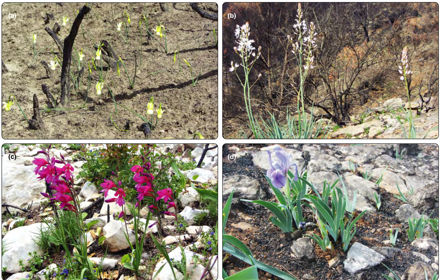
Figure 3. Fire-prone ecosystems are rich in geophytes that flower very quickly after a fire event (fire-stimulated flowering). These species are the first to enhance pollination activity; their underground organs were also an important source of carbohydrates for early humans, and they are the ancestral species of many common contemporary garden plants. Pictured here are geophytes native to Spain that flower quickly after a wildfire: (a) Narcissus triandrus pallidulus , (b) Asphodelus cerasiferus , (c) Gladiolus illyricus , and (d) Iris lutescens .

loads. In British Columbia, Canada, for instance, lungworm ( Protostrongylus spp) loads were up to 10 times smaller in native Stone's sheep ( Ovis dalli stonoi ) that had access to recently burned areas than in sheep that did not (Seip and Bunnell 1985). There is evidence that fire suppression increases the risk and transmission of infectious disease pathogens (eg including those carried by organisms such as ticks, chiggers, fleas, lice, mosquitoes, and a diversity of flies) and modifies host-parasite dynamics in a range of systems (Scasta 2015). For instance, burns are currently used to control the spread of some pest-related problems, such as mosquito-borne diseases. Scasta (2015) referenced 24 studies that document the effects of fire, 23 of which demonstrate fire as an effective tool for managing vegetation, parasites, and disease. Wildfires therefore often serve as a natural control for many diseases and pests that affect wildlife, forests, livestock, and human populations.