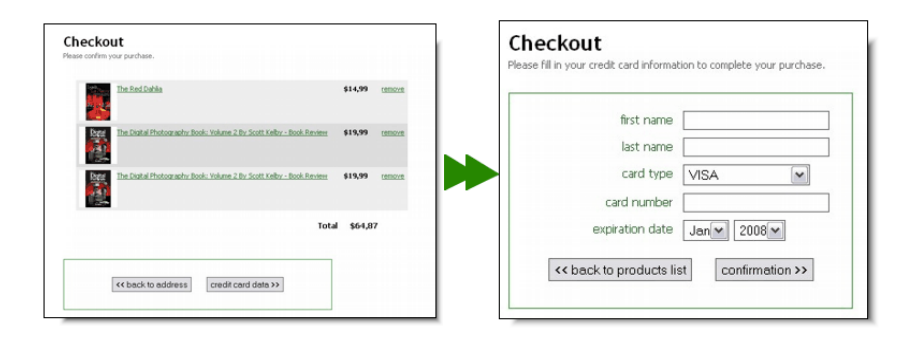
Fig 2. UI mockups for steps 2 and 3 of the checkout process.