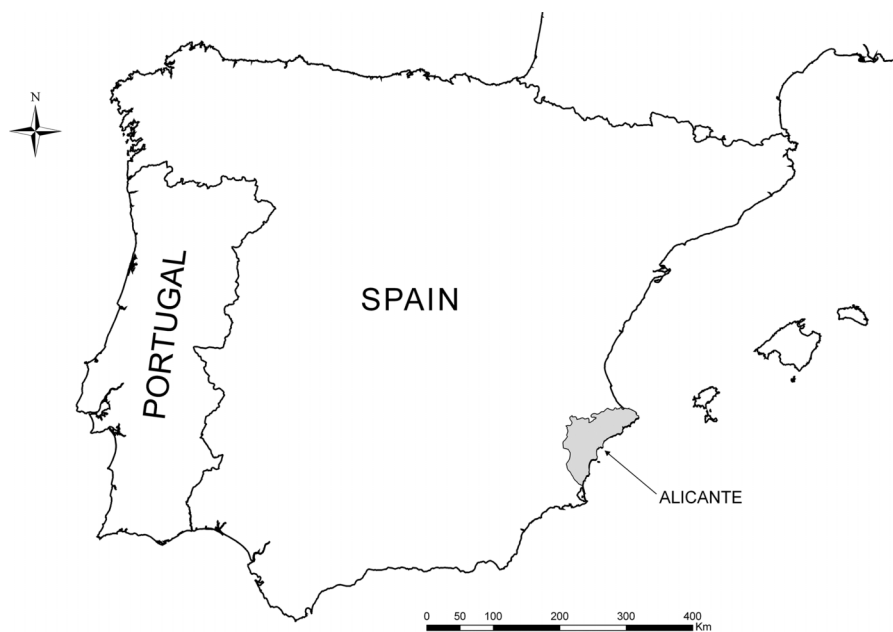
Figure 1. Iberian Peninsula (including Spain and Portugal). The Alicante province (study area) is shaded in grey.

We employed digital trail cameras (Bushnell Trail Scout ® ) with 2.1 Mega pixels of resolution. This device is currently available at hunting stores, and