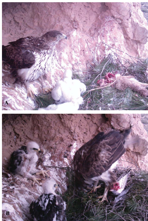
Figure 3. Example of two pictures taken with digital trail cameras to study Bonelli's eagle diet during the nestling period. In both cases the female is present at the nest and the prey delivered are (A) Iberian hare ( Lepus granatensis ), and (B) pigeon ( Columba sp.).

The use of electronic devices has provided new insights in the study of poorly known stages of avian biology; for example, the use of satellite transmitters