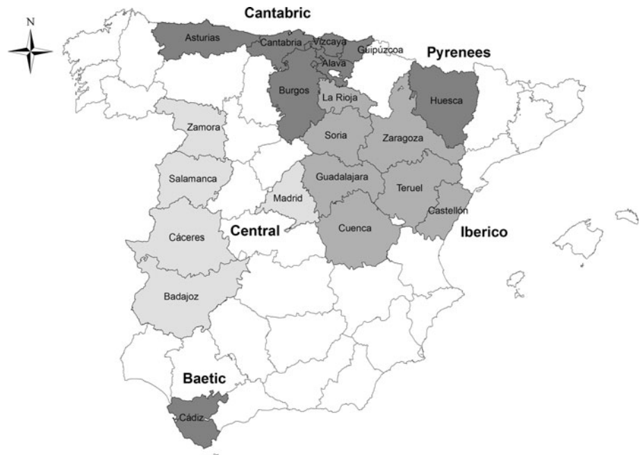
Fig. 1 Study area showing Spanish provinces (administrative units). The provinces included in each of the five populations (in bold ) analysed in the PVA are shown in grey