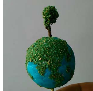
Final result of the Earth model

Make sentences that inspire the protection of our planet Earth (these phrases will be cut and attached on the stick that holds the earth and will be published on our website and social networks.