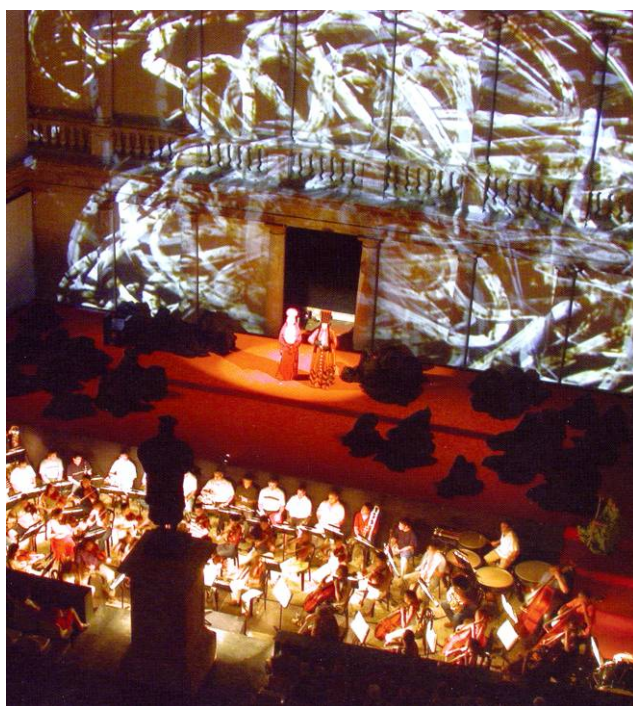
Performance of Edipo Rey

diverse cultural supply at the service of an ambitious cultural project that enhances the meaning of the emblematic university building and complements Valencia's cultural offer on the basis of reflection, dialogue and service, which have been the foundations of the academic institution ever since it was founded, more than 500 years ago.