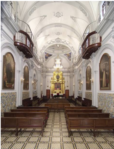
The Sapience Chapel