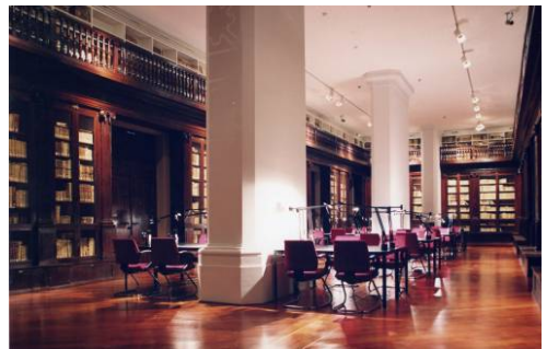
Sala Pérez Bayer

Among its most valuable assets is a collection of codices and manuscripts originally coming from the Royal Library of Naples, which was transferred to the Valencian Monastery of San Miguel de los Reyes by Fernando of Aragón, Duke of Calabria.