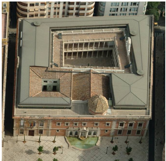
Universitat de Valencia. Estudi General

Today, the university's academic activity is developed at colleges and schools scattered around three campuses and at different research institutes around the city. The historic building caters for the Historic Library, the rector's rooms and different administrative and cultural services.