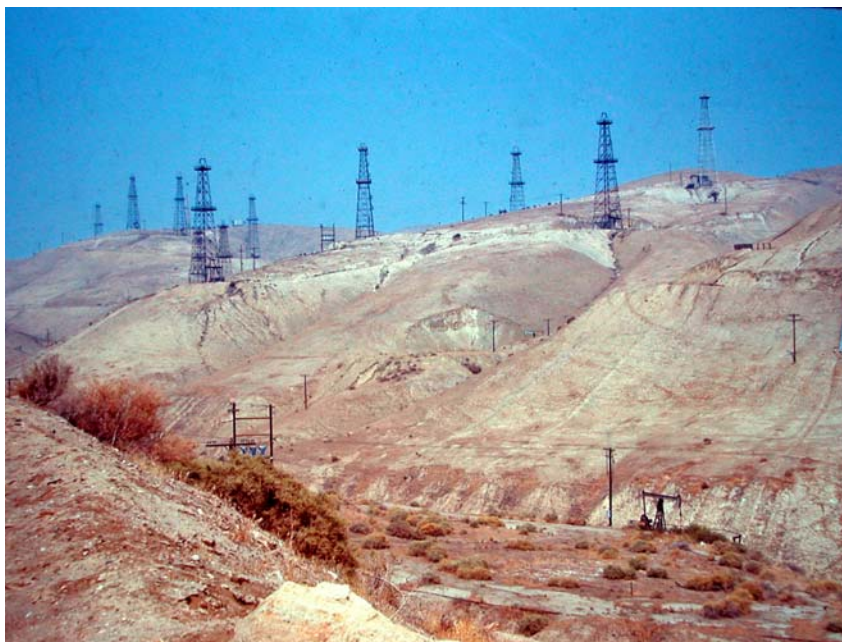
Figure 1. A California oil field. Like the rest of the world, early California oil fields were quite productive but began to lose their higher volumes in mid-century. Many of these wells were sold to small independent operators who could make them profitable. Most of these fields are still active. Here, the Round Mountain Oil Field, which has produced over 100 million barrels of oil since it was spudded in 1927, making it a "giant" field. J. H. Lipps image, 1960.

The level of ignorance about oil is compounded in the US by the recent rapid increase in the cost of gasoline. Everyone is up in arms and everyone has a solution. Few have the facts. Nothing provokes emotion in America like fooling with people's cars—we love them dearly and many love the biggest ones best of all. America