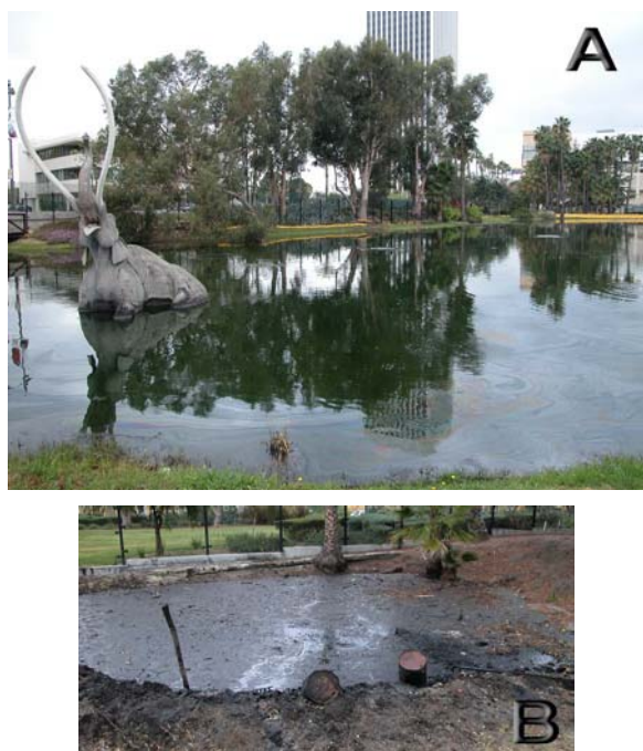
Figure 2. Probably 90% of oil formed in the sedimentary deposits of the world has migrated to the earth's surface where it formed oil seeps and pools, and eventually disappeared altogether. Here, at the famous La Brea deposits on Wilshire Boulevard (A) in Los Angeles, California, active oil seeps from underlying Tertiary rocks form pools in Pleistocene and Recent alluvium (B). These pools, like so many others in the world, have trapped animals, plants and protists in the gooey mess.

long period of time. Although the open ocean has a lot of production overall, in any particular place it is low, so low that most of the material is absorbed back into the water or degraded otherwise. Overall, the productive areas amount to about to less than 20% of the oceans today, and the most productive upwelling regions amount to a fraction of that. Even that amount of captured productivity would release us from the oil squeeze, but there's more to it naturally.