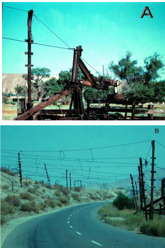
Figure 3. In the early 1900s, oil was regarded as infinite in supply, as more and more giant and super giant oil fields were discovered. Early methods of extraction included hand-dug wells, then impact tools, and finally rotary drilling bits in 1901. The wells shown here were drilled along the Kern River in central California. Like almost all wells, they require pumping to lift the oil to the surface—very few wells flow under their own pressure which is rapidly depleted. The pumping method shown here was to link the pump jacks (A) over a wide area by cables (B) to a single engine that pulled them up and down to pump the oil. All oil costs money to produce, and those costs have grown dramatically over the history of the industry and will continue to grow as more and more difficult oil is produced. J. H. Lipps image, 1960.

much or under too much pressure, and they have to be exposed at a particular place in the Earth (road cut, hillside, etc). They do not have to experience a particular diagenetic process that changes them into something we seek; indeed we try to avoid such places. Thus far the taphonomic principles are remarkably similar between the usual fossils we study professionally and the fossil fuels we need in our ordinary lives.