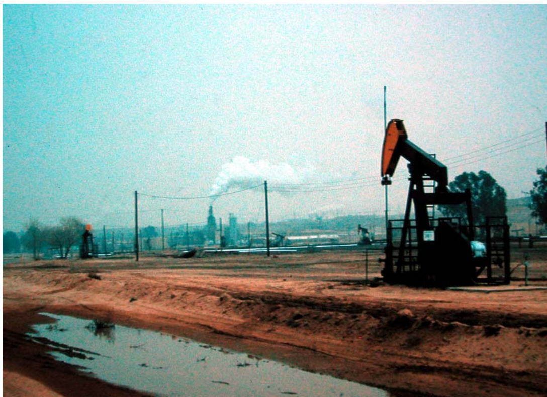
Figure 5. Secondary recovery is used in most oil fields to enhance production. Water is injected commonly and is used in Saudi Arabian fields, while steam shown here is used too. The steam plants, shown in the distance venting steam, pump steam into the oil-bearing strata and force the oil to other wells nearby where it is extracted. The technique works on heavy crude and fields that are somewhat depleted. See http://www.heavyoilinfo.com/thermal . J. H. Lipps image, 1960.

the more distant future. Taphonomy shows us there's not a lot left.