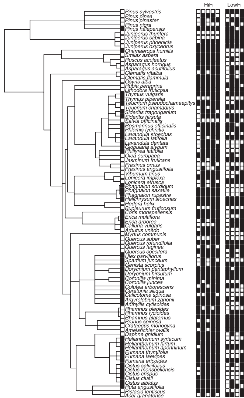
Fig. 2. Phylogenetic tree of the species considered, including the state of P in the tips (P+ and P– in black and white squares, respectively) and the presence-absence matrix (black and white squares, respectively) for the five HiFi and the four LowFi sites studied (see Table 1 for details of the sites).

Evolutionary conservatism in the P trait was analysed by evaluating the existence of a phylogenetic signal in our tree. To ensure that the conservatism of P is not a reflection of the local filtering processes we further evaluate the phylogenetic signal in a worldwide data set (from Pausas et al. 2004) that includes 1039 species. There is evidence of little correspondence between the different methods for testing trait conservatism (Webb et al. 2002); thus we used two different methods. The first method compares the correlation value between the phylogenetic and the trait distance matrices against the distribution generated by a null model in which the tips of the phylogeny were randomly